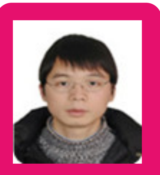
May 16 (Saturday) 11:40am – 12:20am